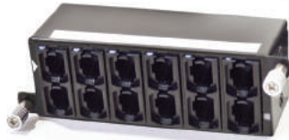
MTP ® Feed-Through